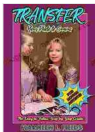
Photo-to-canvas transfer involves transferring a digital photograph onto a stretched canvas using specialized printing techniques. The result is a high-quality, durable print that replicates the essence and emotions of the original image. The canvas material provides a textured surface that adds depth and character to the photograph, creating an artistic and heirloom-worthy piece.

In this comprehensive guide, we will delve into the captivating world of photo-to-canvas transfer. We will explore the techniques involved, the materials required, and the essential steps to ensure your cherished moments become masterpieces on canvas.