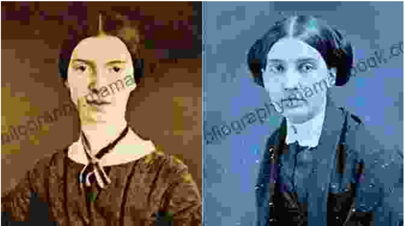
Susan Huntington Gilbert, Emily Dickinson's close friend

Gilbert shared Dickinson's love of literature and often engaged in lively discussions with her friend. She also offered practical assistance, helping Dickinson with household chores and providing a listening ear during her periods of emotional turmoil.