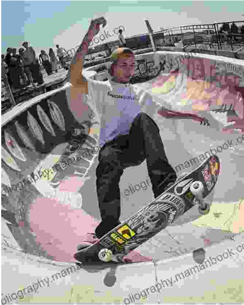
A skateboarder showcasing their skills on a custom-made skateboard