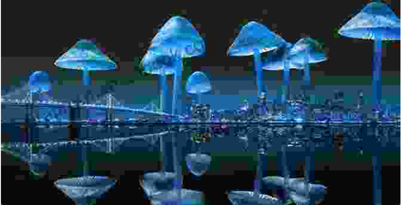
The City, 1952

today. His work can be found in major museums and galleries around the world, and his images continue to be celebrated for their haunting beauty and enigmatic power.