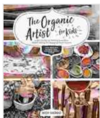
Image of brush made from a reed by